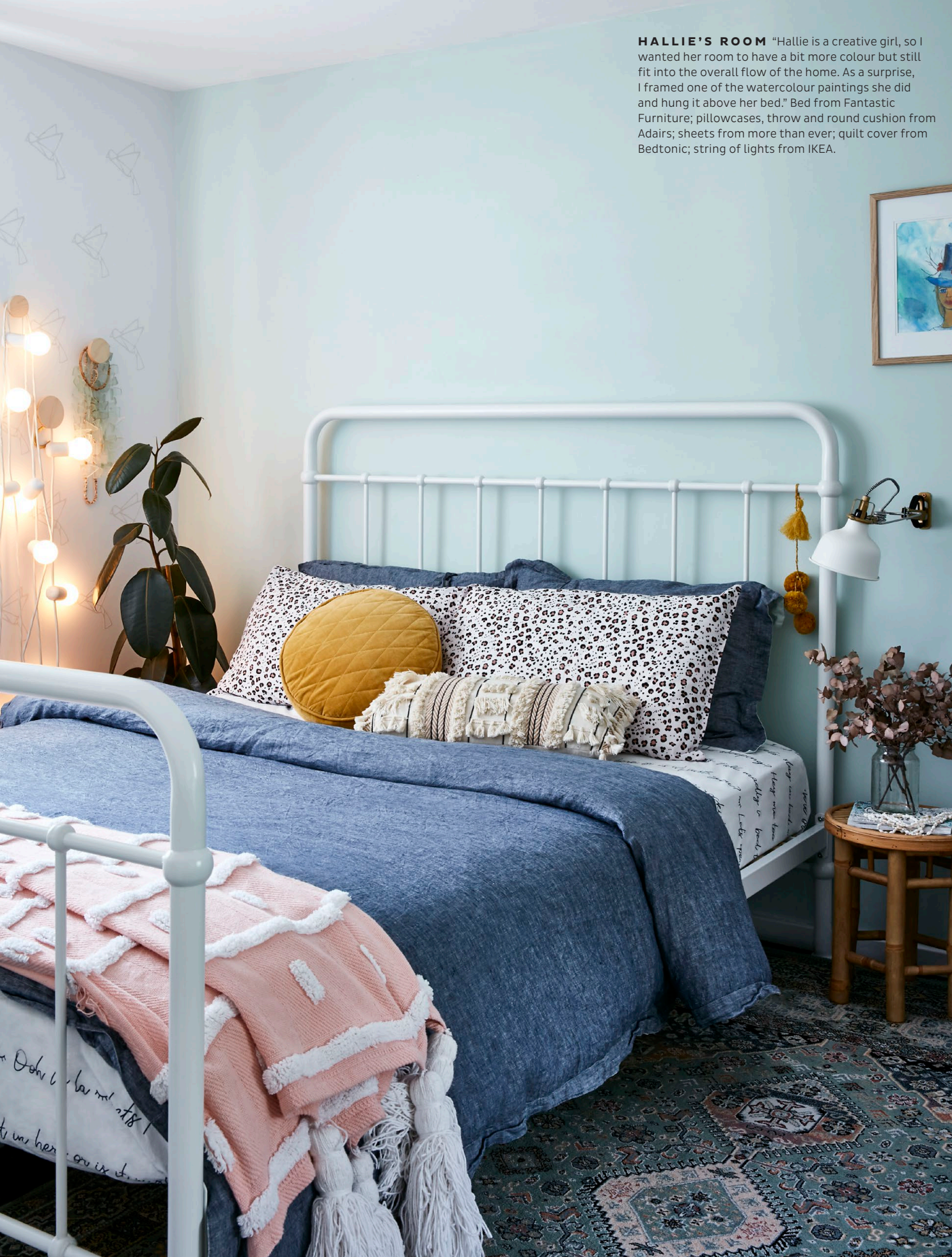
HALLIE'S ROOM "Hallie is a creative girl, so I wanted her room to have a bit more colour but still fit into the overall flow of the home. As a surprise, I framed one of the watercolour paintings she did and hung it above her bed." Bed from Fantastic Furniture; pillowcases, throw and round cushion from Adairs; sheets from more than ever; quilt cover from Bedtonic; string of lights from IKEA.